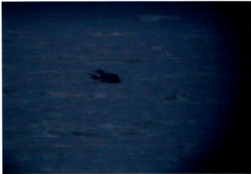
Band-rumped Storm-Petrel 052-01-2006 VanSiverLake, Bucks Co 9/2/2006